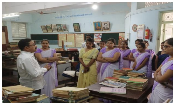
Figure 1 Library Orientation of Students